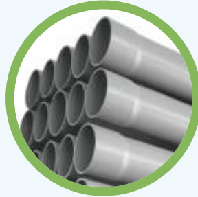
PVC PIPES & FITTINGS