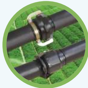
SPRINKLER PIPES & ACCESORIES