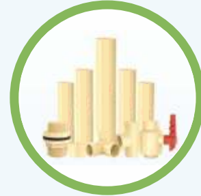
CPVC PIPES & FITTINGS